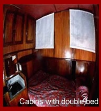
Cabins with double bed